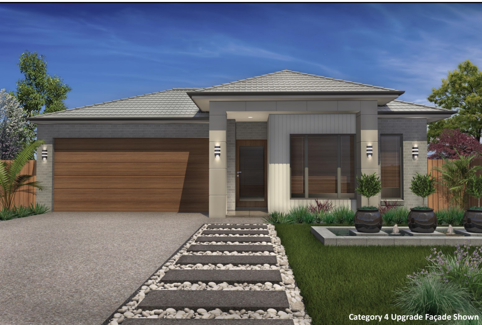
Category 4 Upgrade Façade Shown