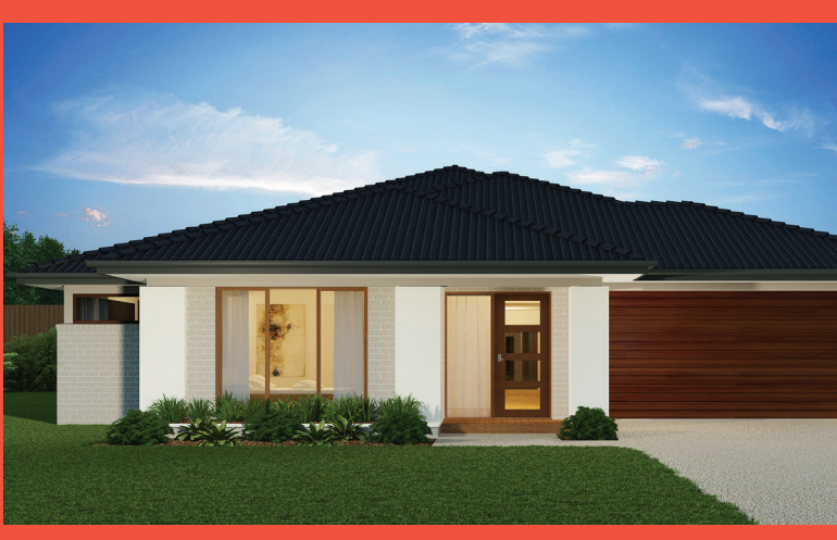
Façade colours and materials shown may not be available due to land estate design guidelines Refer to your Henley new home consultant for clarification. Price excludes tiles, stone and/or full render to façade treatment if shown, timber windows, landscaping, fencing, driveway,decking, planter box and decorative lights or any change required by Developer to