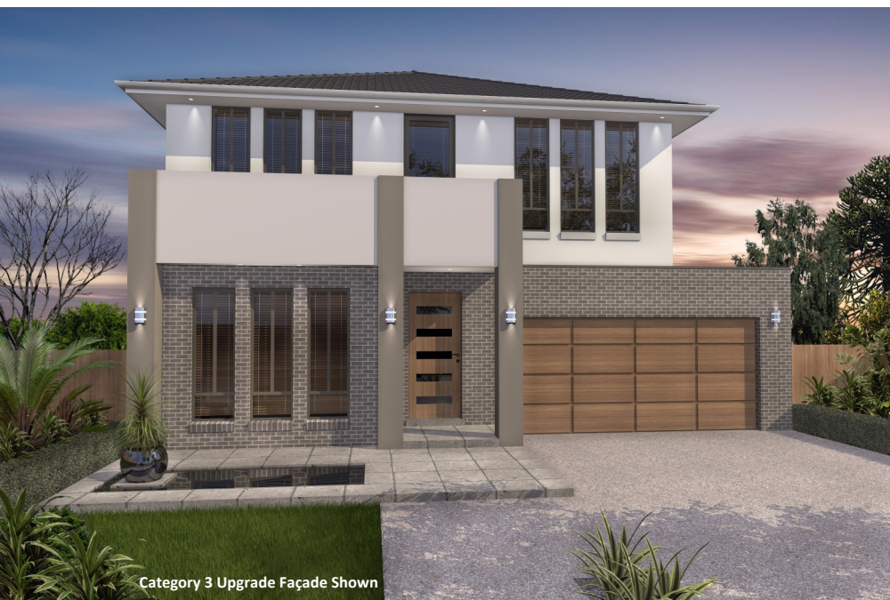
Category 3 Upgrade Façade Shown