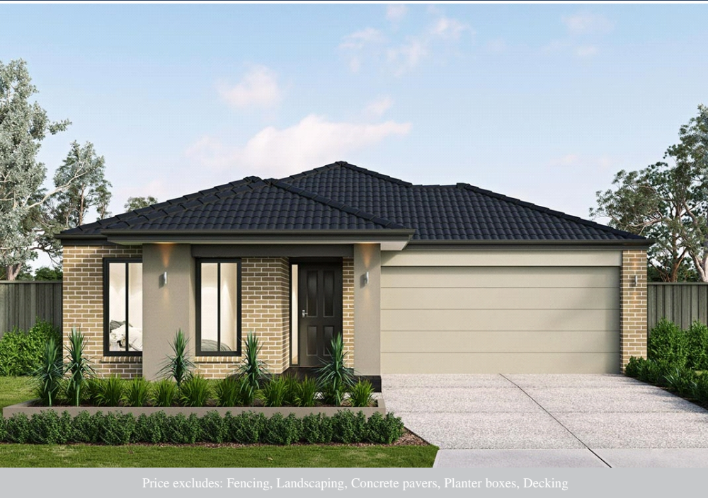
Price excludes: Fencing, Landscaping, Concrete pavers, Planter boxes, Decking