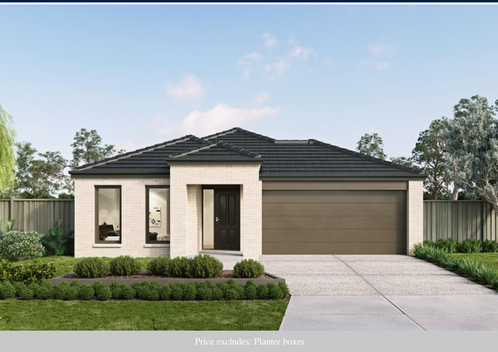
Price excludes: Planter boxes