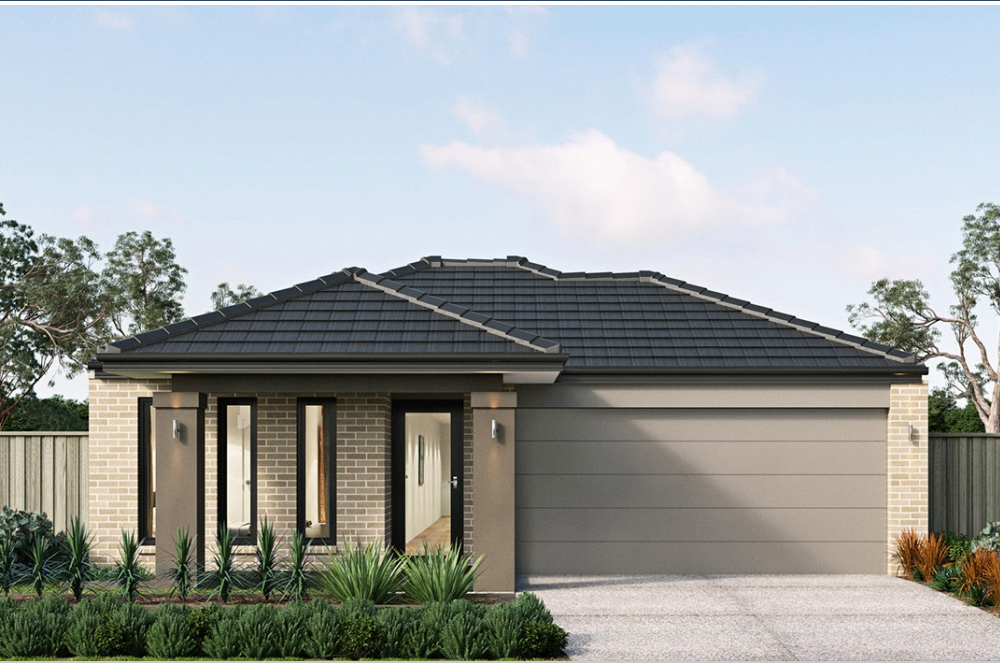
Price excludes: Planter boxes