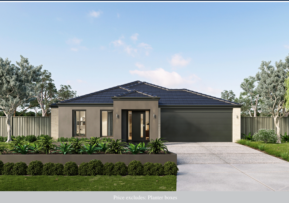
Price excludes: Planter boxes